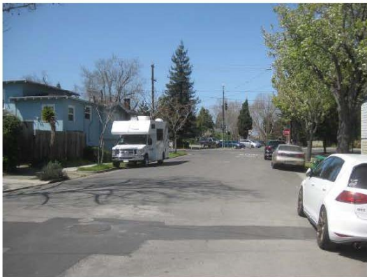
LOOKING WEST ALONG EAGLE AVENUE