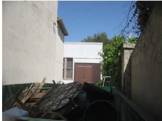
EAST DRIVEWAY TO REAR WAREHOUSES