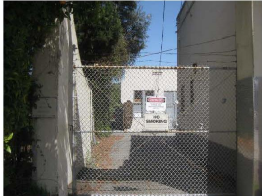
WEST DRIVEWAY TO REAR WAREHOUSES