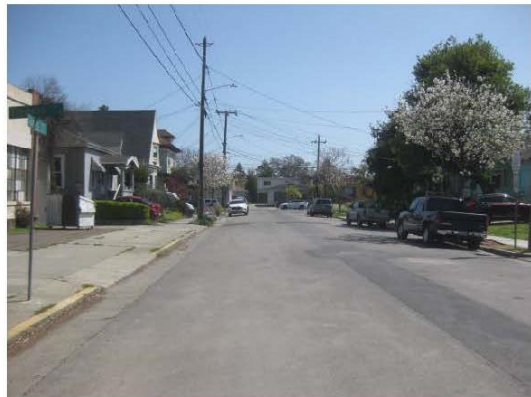
LOOKING EAST ALONG EAGLE AVENUE