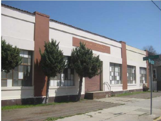
FRONT OF SUBJECT FACING EAGLE AVENUE