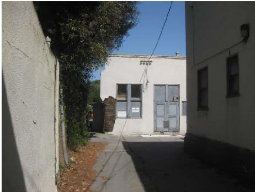
LOOKING NORTH AT REAR WAREHOUSES